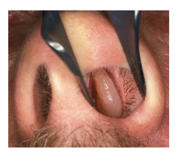
Figure 2. How a nasal polyp looks like.